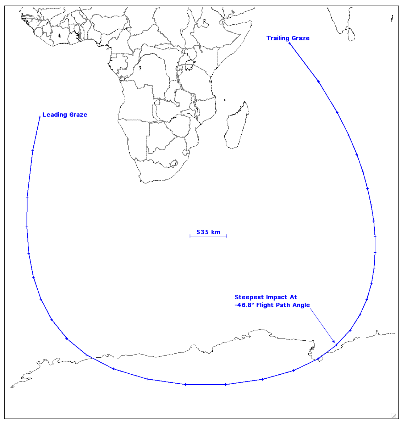
Figure 3. The LEMUR locus of all possible Earth collisions for 2013 TV<sub>135</sub> on 26 August 2032 is confined to marine regions about southern Africa and adjacent Antarctic territory. This mapping is subject to 2013 TV<sub>135</sub> predicted position uncertainties and could be in error by 535 km or more in either lateral direction from the LEMUR locus.

From JPL#7, Sentry also estimates 2013 TV<sub>135</sub> lateral position uncertainty from the LOV to 1 sigma confidence on 26 August 2032 as a "semi-width" of 0.0839 Earth radii or \pm 535 km. Bearing in mind this uncertainty, the LEMUR locus of all possible Earth collision points on 26 August 2032 is plotted in Figure 3.